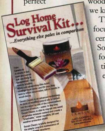
Sansin ad from 1999.