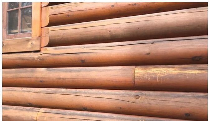
Exposed Facing Side