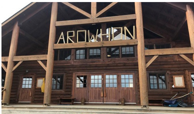
Exposed Facing Side