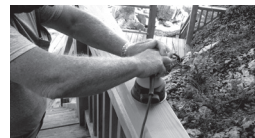
FINISH SANDING #60-#80 GRIT