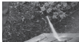
CLEAN USING SANSIN MULTI-WASH™