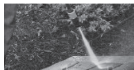
PRESSURE WASHING 3000 PSI