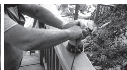
FINISH SANDING #60-#80 GRIT