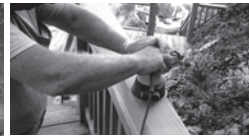
FINISH SANDING #60-#80 GRIT