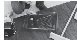
APPLY WITH A GOOD QUALITY BRUSH OR PAD APPLICATOR OR BY SPRAYING