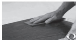
SANDING #120-#150 GRIT WITH THE GRAIN