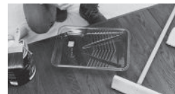
APPLY WITH A GOOD QUALITY BRUSH OR PAD APPLICATOR OR BY SPRAYING