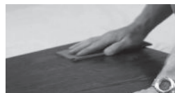
SANDING #120-#150 GRIT WITH THE GRAIN