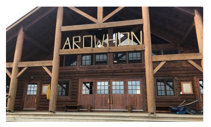
Exposed Facing Side