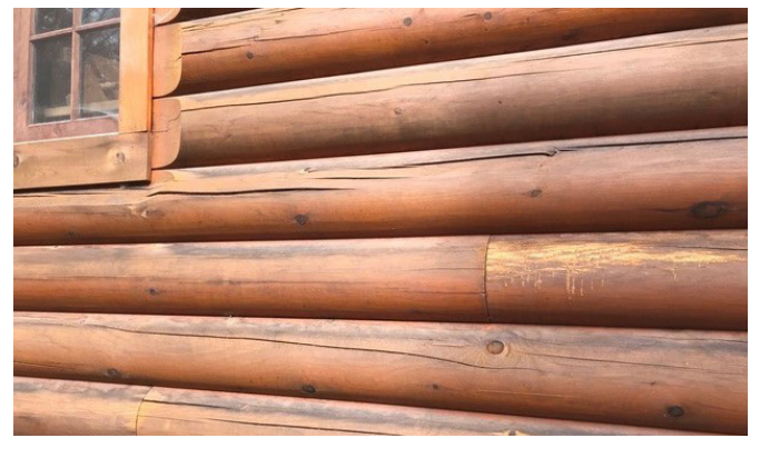
Exposed Facing Side