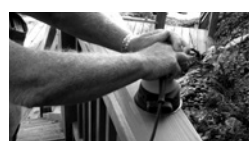
IF NECESSARY, FINISH SANDING