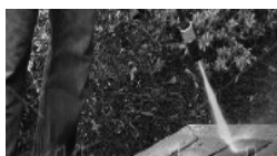
PRESSURE WASHING 2500 PSI