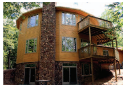
The warmth of wood – in fibre-cement

New technology and designs have made fiber-cement siding look ever more realistic and sophisticated. Now with Sansin's advanced NanoTints™ color technology, you can add the warmth and color of wood to your fibre-cement siding with Sansin C-Tec.