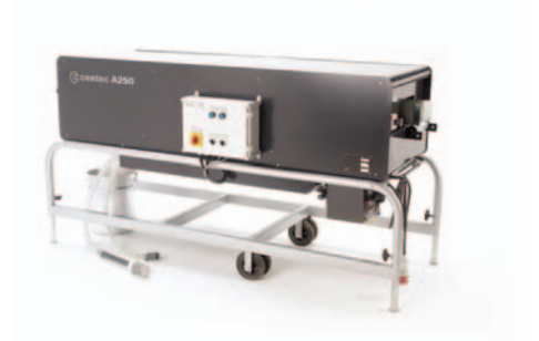
High solids for easy factory application

with fiber-cement substrates, it's highly resistant to dirt and to surface marring – which means your siding will be easier to transport and install. C-Tec also enhances the natural water-repellent characteristics of fiber-cement siding and protects against UV degradation. Sansin C-Tec's high-solids formulation can be applied in only two coats for maximum beauty and protection with a minimum of factory application.