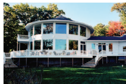
Low in VOCs and enviro-friendly

Like all Sansin Enviro Stains, Sansin is formulated to be environmentally-friendly with exceptionally low VOCs. And because it bonds molecularly